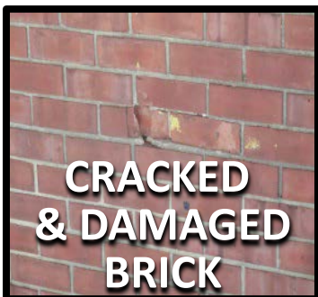
CRACKED & DAMAGED BRICK