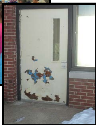
Old doors & windows