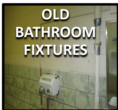
OLD BATHROOM FIXTURES